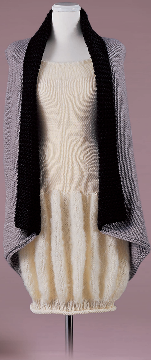
Snow Flakes Soon Oh Kyungwon College (Korea)