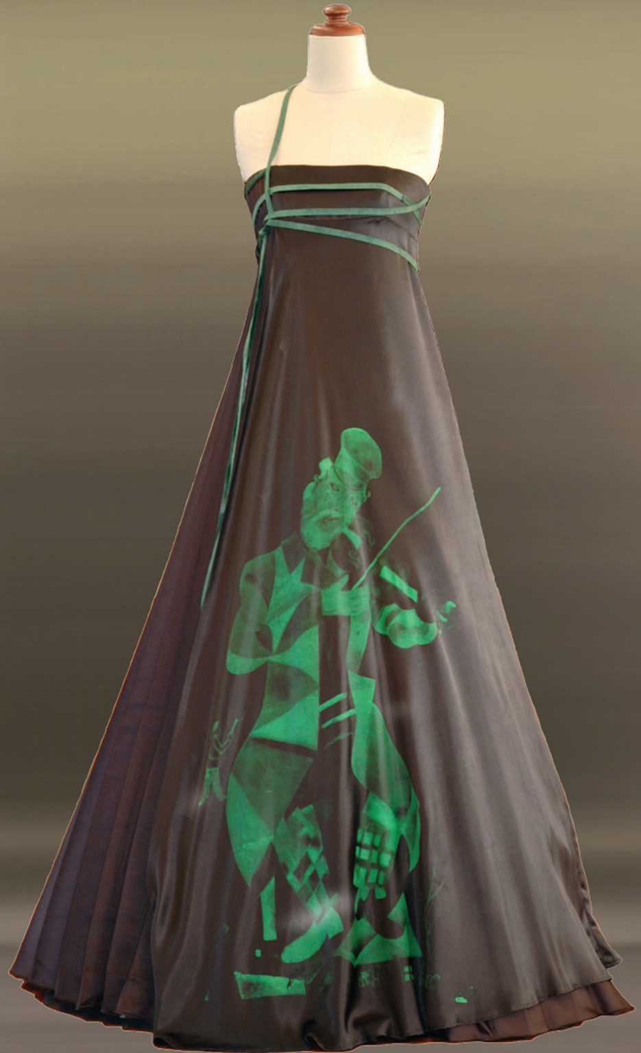
Dream of Peace Kate Moon East Sydney TAFE (Australia)