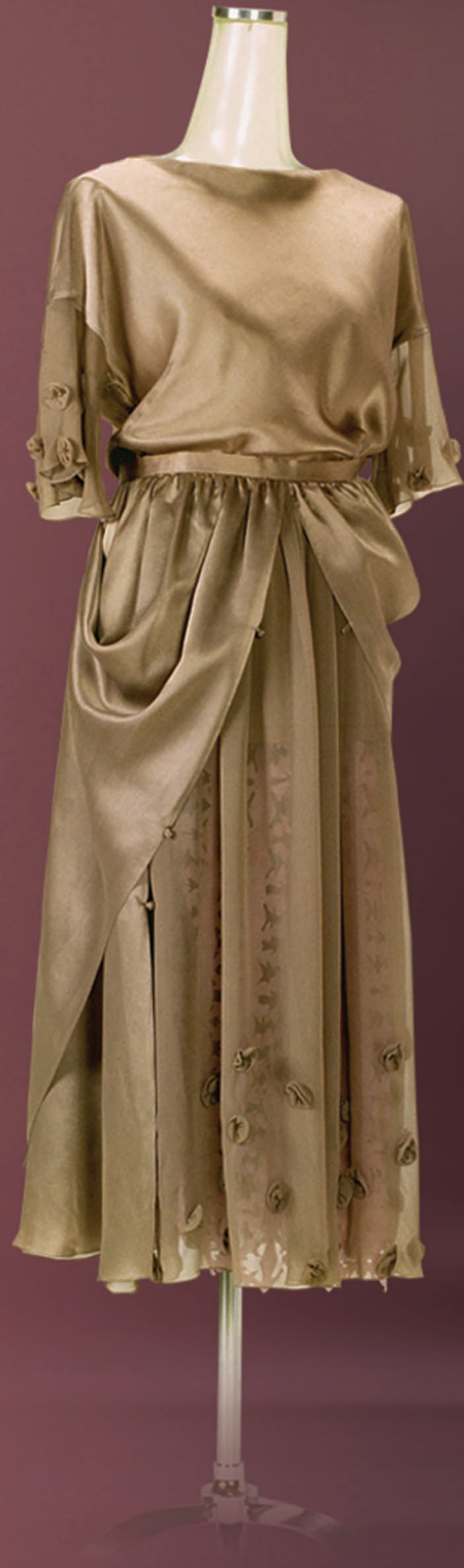
Kkot Mun - Paper in Elegance Dress

Myeng - Ok Moon Donggeui University (Korea)