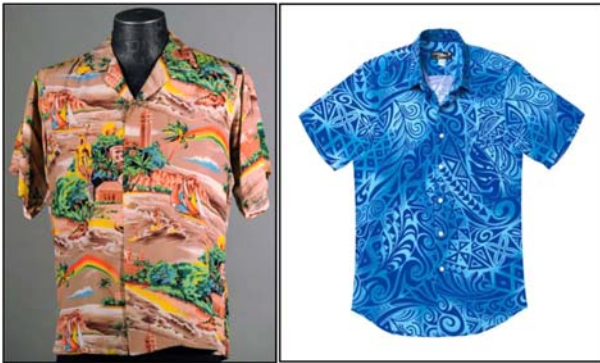
Fig. 1. Left – Two examples of a typical Hawaiian shirt. The shirt in the left features iconic scenes associated with the Hawaiian Islands (University of Hawai‘i, 2018), while the shirt on the right features geometric designs reminiscent of Polynesian tattoo (Kai, 2018).

selecting Hawaiian shirts (Morgado, 2003, 2005). The purposes of this study are to examine the validity of the assumption that tourist taste and resident taste in Hawaiian shirts are different and to investigate the current market change of the Hawaiian shirt.