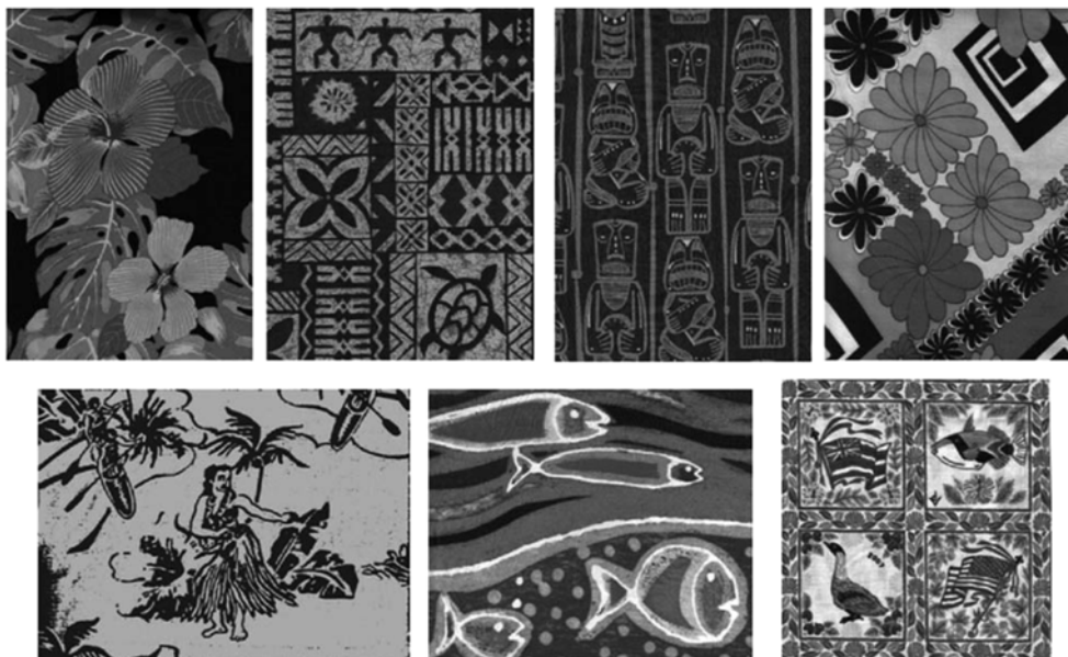
Fig. 3. Seven prints represented or long time good sold in the Hawaiian shirt market in Hawai'i: from the left top to right – hibiscus, kapa, tiki, kitsch (or retro): from the left bottom to right – hula dancers, fish, and the state bird (nene goose).

The researchers employed a convenience sampling method by initiating contact with owners of retailers or wholesalers who are